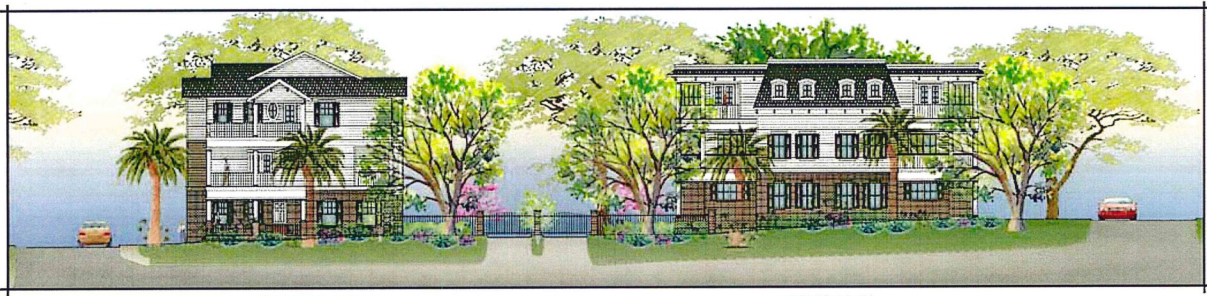
BUILDING #2 SOUTH ELEVATION